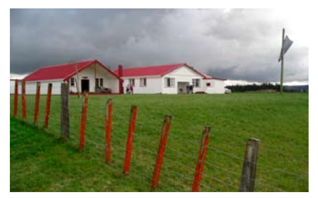
Tirorangi Pā, Karioi