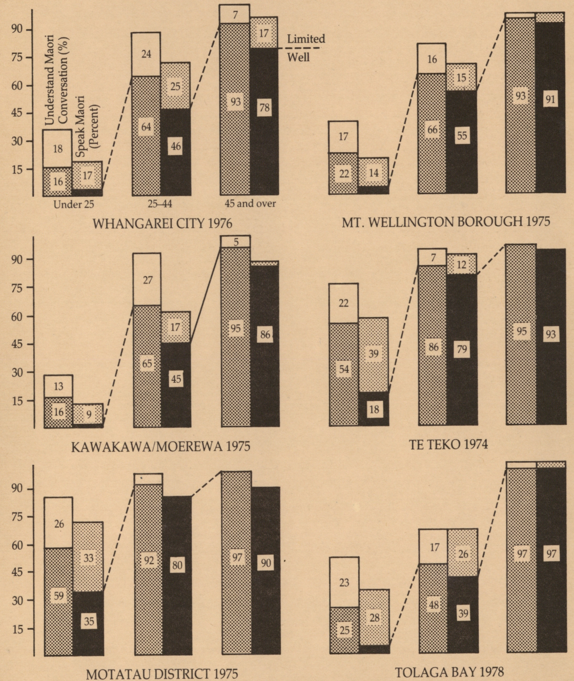
Knowledge of Maori Language by Age Groups in Selected Areas at the Time of the Linguistic Census