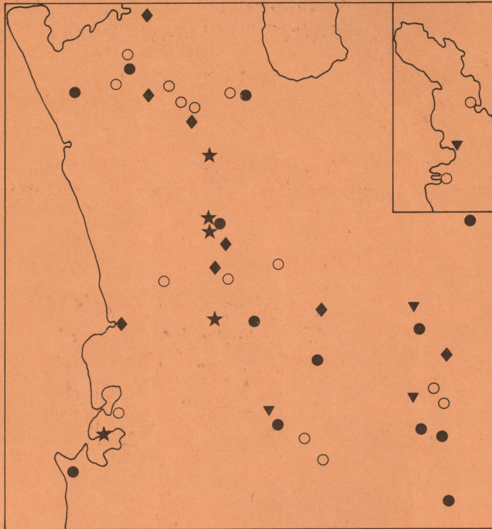
Map showing Towns and Localities of the Waikato Region of the North Island visited during the Census of Language use

The table on the next page shows that all good speakers of Maori, and those who understood the language well, were adults over the age of 25. A third of the people surveyed hardly knew any Maori at the time - most of these were school-age children. Some of the reasons for the drop in the number of people who knew the language are examined in the following pages.