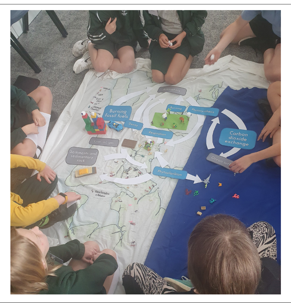
FIGURE 2 Interactive carbon cycle activity

The final Mana Ora event was a celebration day in November 2023, coinciding with the Auckland Enviroschools celebration event. All Mana Ora schools and projects were invited to bring the lead teacher and up to four students to the gathering. Participants from 11 of the English-medium projects were able to attend, mix and mingle, hear speeches, and showcase their project in a small walk-around exhibition area.