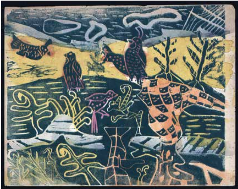
Figure 1.3: Quail , lino print

in special places in the classroom. In this way, a shared sense of aesthetic values was established.