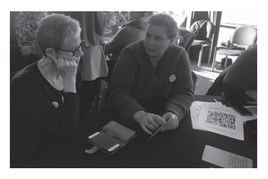
FIGURE 6. TWO TEACHERS AT THE DUNEDIN ARONUITIA TE REO WORKSHOP DISCUSS THE IMPORTANCE OF TEACHING TE REO MĀORI

Like you just did, teachers using the Whakaarohia set are invited to select a card that interests them. Next, they are encouraged to use the prompts on the back of their card to think about and discuss the finding that caught their attention. These prompts, which include questions like, "What conclusions might be drawn from the information [on your card]?" and "What might the information mean for your school?", generated rich discussion at the recent Aronuitia te reo workshops. Many teachers commented that they could see how the conversations that the cards stimulated would prompt their schools to reflect upon and strengthen their reo Māori programmes.