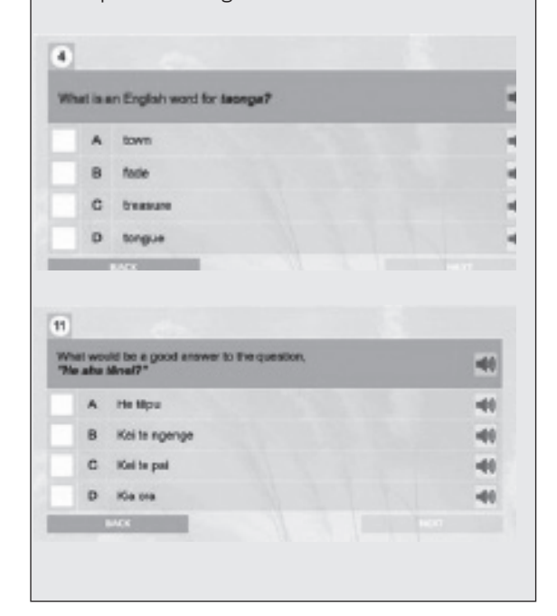
TEXT BOX 1. EXAMPLES OF SELECTED-RESPONSE ITEMS FROM THE TRM ASSESSMENT

Designed to assess students' knowledge and understanding of a selection of reo Māori words and phrases, the TRM assessment included a mix of selected-response and short constructed-response items. Students answered the selected-response questions on a computer while the open-ended questions were completed by hand. As can be seen in Figure 1 below, the computer-based items included an audio option, which enabled students to hear, as well as read, the question being asked.