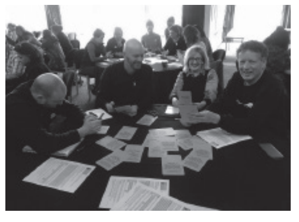
FIGURE 4. TEACHERS AT OUR DUNEDIN WORKSHOP EXPLORE RESOURCES ON THE WHAKAMAHIA CARDS

Teachers who attended the Aronuitia te reo workshops in August 2021 told us that they found the Whakamahia set to be very useful. They commented that it would help them build up their school's bank of reo Māori resources. The teachers particularly liked the way the QR codes allowed them quick and easy access to websites.