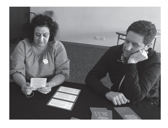
FIGURE 9. TEACHERS AT AN ARONUITIA TE REO WORKSHOP CONSIDER A CARD FROM THE WHAKARAUORAHIA SET

Because the Whakarauorahia set includes a series of discussion prompts, it provides teachers with opportunities to ponder findings like the one above, and to think about how well they reflect their own school's situation. These prompts, which are designed to encourage schools to think about how well positioned they are to assist with supporting the Crown's strategy for revitalising te reo Māori, also invite teachers and school leaders to identify ways in which they could strengthen their provision of reo Māori learning opportunities.