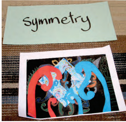
Fig 2.1 Maths and art

thematic units, subjects are placed at the centre and the curriculum design “forces a fit” across the curriculum. In curriculum integration, issues form the centre, and learning areas are drawn upon when required.