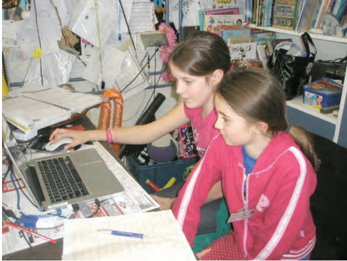
Fig 2.2 Girls searching for relevant information online

A further challenge that is known to cause concern is teachers' lack of knowledge about curriculum integration. When not done well, curriculum integration can become as forced or artificial as any poorly executed approach, resulting in lack of student motivation and engagement (Beane, 2005; Jacobs, 1993; Murdoch & Hamston, 1999). Another impediment for some is the concern that they will not be covering what the curriculum requires. Teachers do need to remember the big picture and ensure their music programme, for instance, is not overlooked just because music does not feature in an integrated unit. There is place and space for stand-alone subject teaching alongside any integrated unit. The erroneous belief that curriculum integration incorporates all learning areas leads some to raise this concern. Curriculum integration only draws on those learning areas germane to the inquiry at hand.