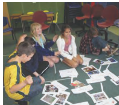
Fig 2.3 Year 5/6 children identifying cross-curricula connections